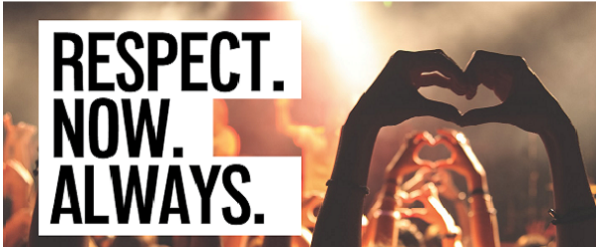
Image above: (cropped)