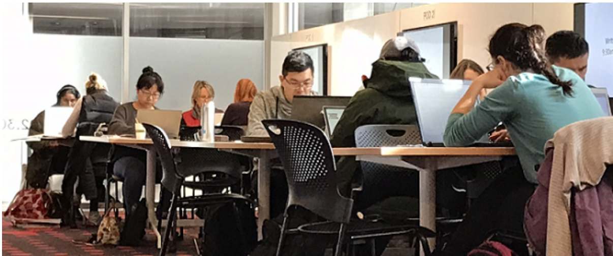
Image bottom: 3MT finalists 2019